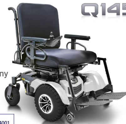
Q1450 with Synergy® Seating